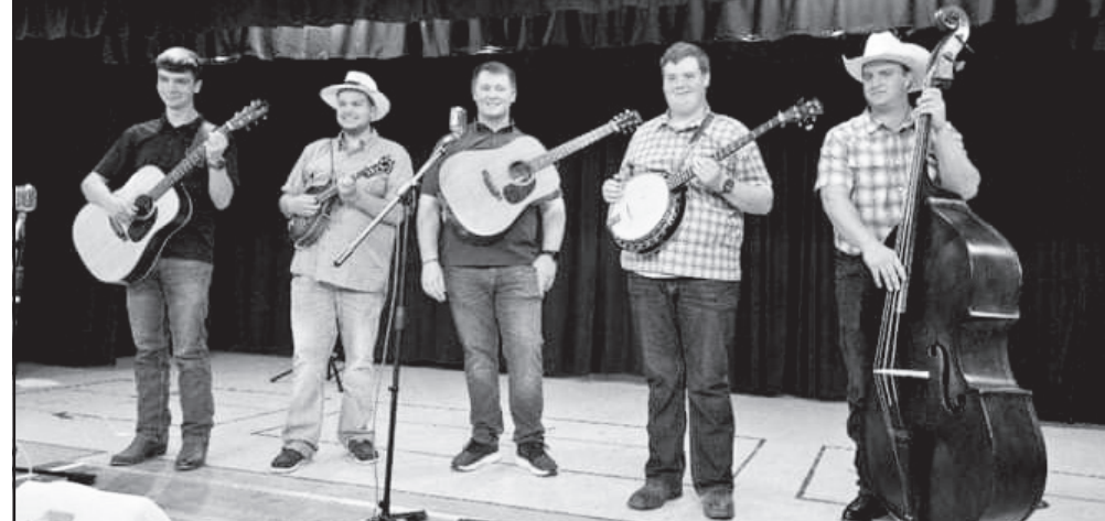
The Deep River Boys

The Deep River Boys will be in concert the East Tennessee and North Georgia area, Friday, August 9th, at the Old Courthouse on