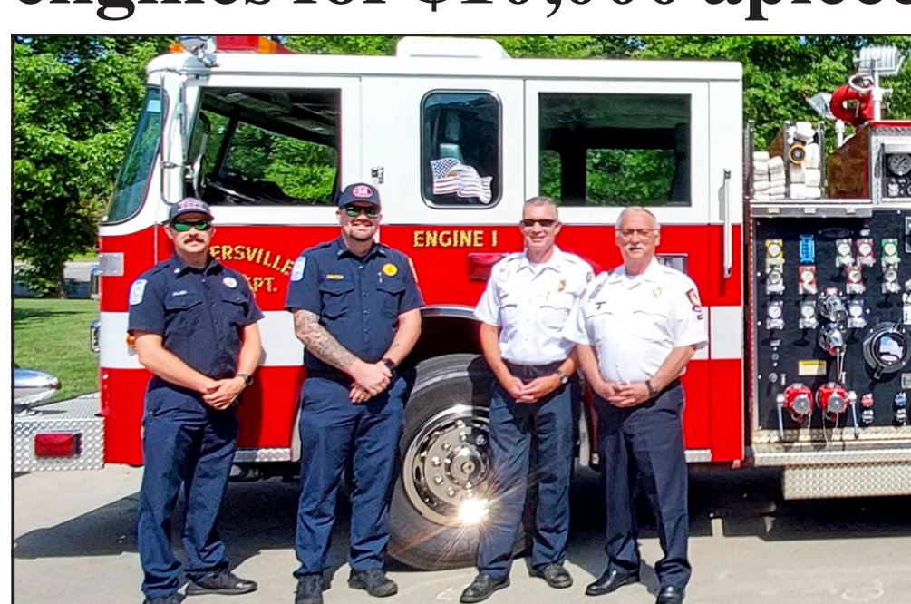
Union County Fire is grateful to the Fire Department and officials of neighboring Cartersville