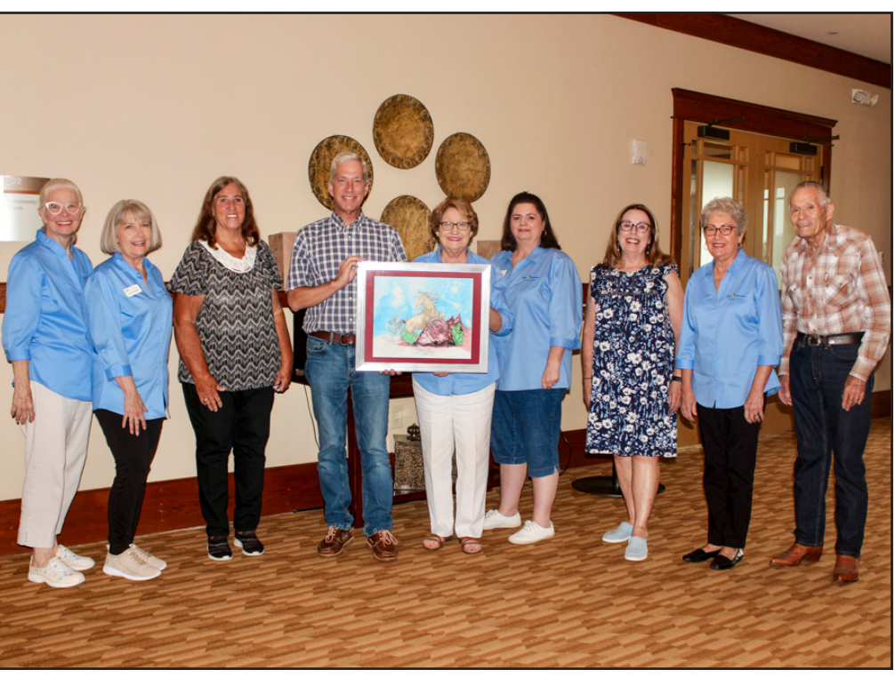
Ferst Readers of Union County volunteers are incredibly excited to be raffling off this unique piece of artwork, with tickets available at United Community Bank in Blairsville.