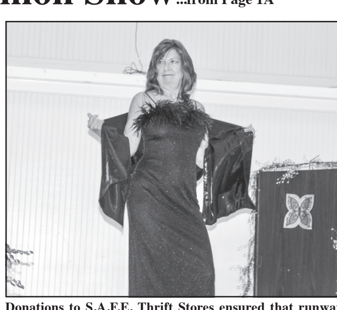
Donations to S.A.F.E. Thrift Stores ensured that runway participants had something elegant to wear on Saturday.

That said, the fashion show and prizes weren't the only things to liven up the