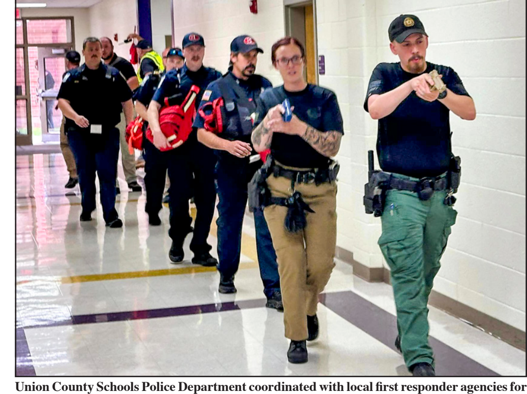
an active shooter training event toward the end of July.

Parents of Primary School students, make note - Aug. 7 will be Meet Your Teacher by appointment only.