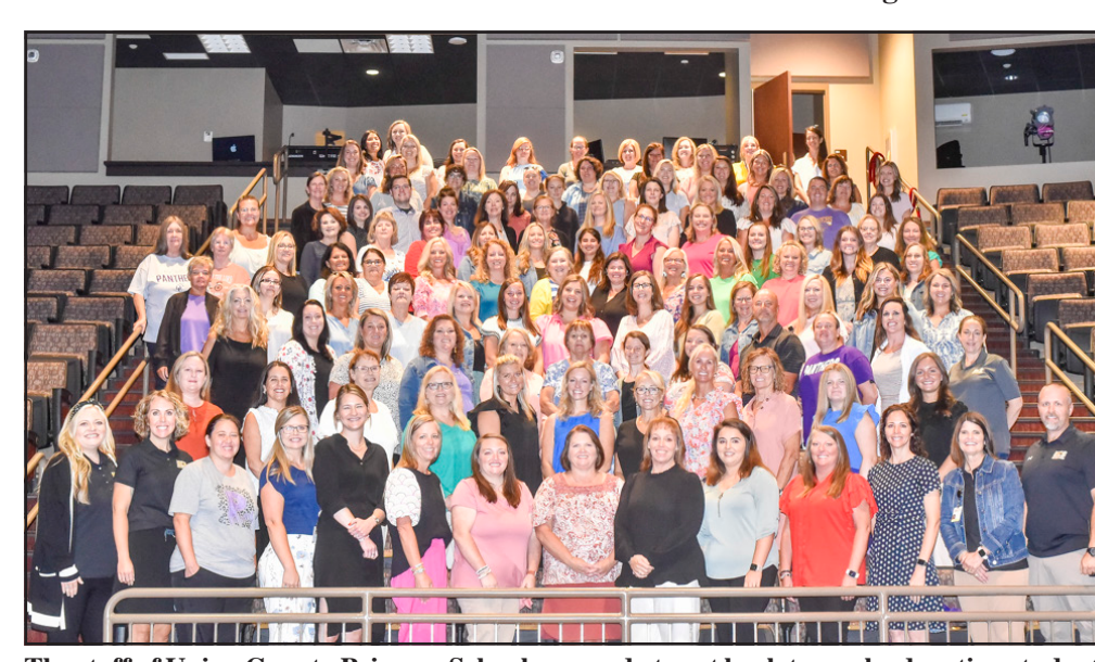
The staff of Union County Primary School are ready to get back to work educating students, Photo by Todd Forrest posing here during the first day back for teachers on Aug. 1.

School, parents can stop under the front awning to drop off their students. As such, there will be a different traffic pattern for that school, but the patterns are largely the same for the other campuses.