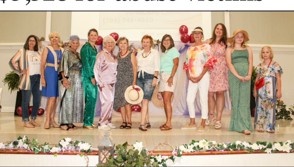
Volunteer models had a blast showing off various modes of fashion for a good cause in the Aug. 3 S.A.F.E. fundraiser.