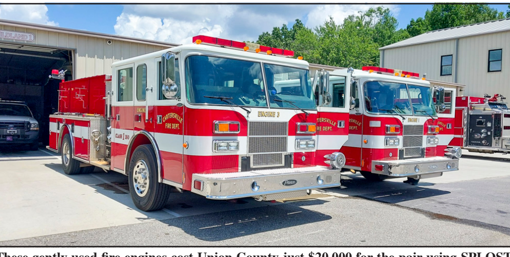
These gently used fire engines cost Union County just $20,000 for the pair using SPLOST

was replacing two of its reserve trucks. Not frequently "on the front lines," the engines were in exceptional shape and had plenty of life left in them.